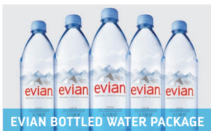
EVIAN BOTTLED WATER PACKAGE

$10 PER PERSON/PER DAY INCLUDING GRATUITY