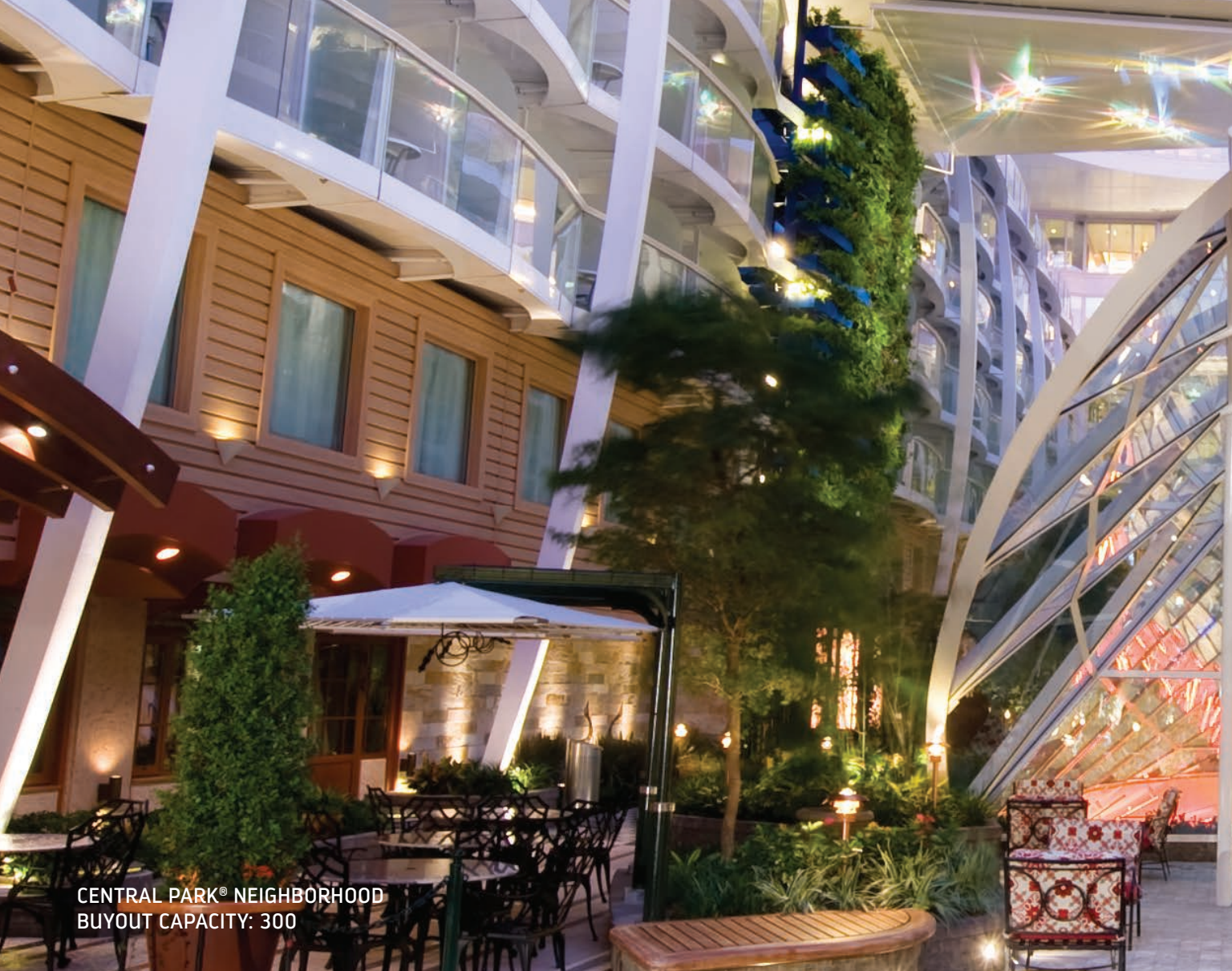
CENTRAL PARK® NEIGHBORHOOD BUYOUT CAPACITY: 300