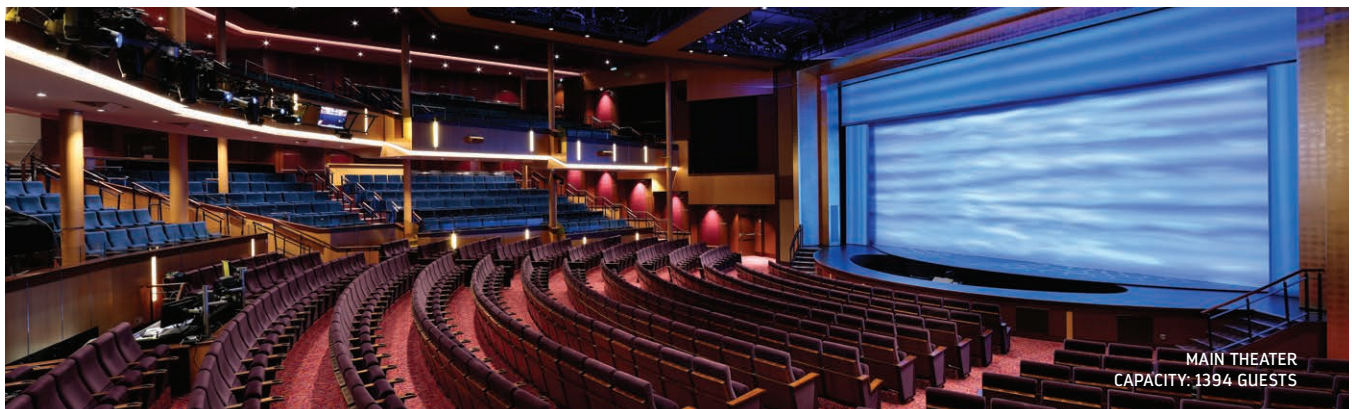
MAIN THEATER CAPACITY: 1394 GUESTS