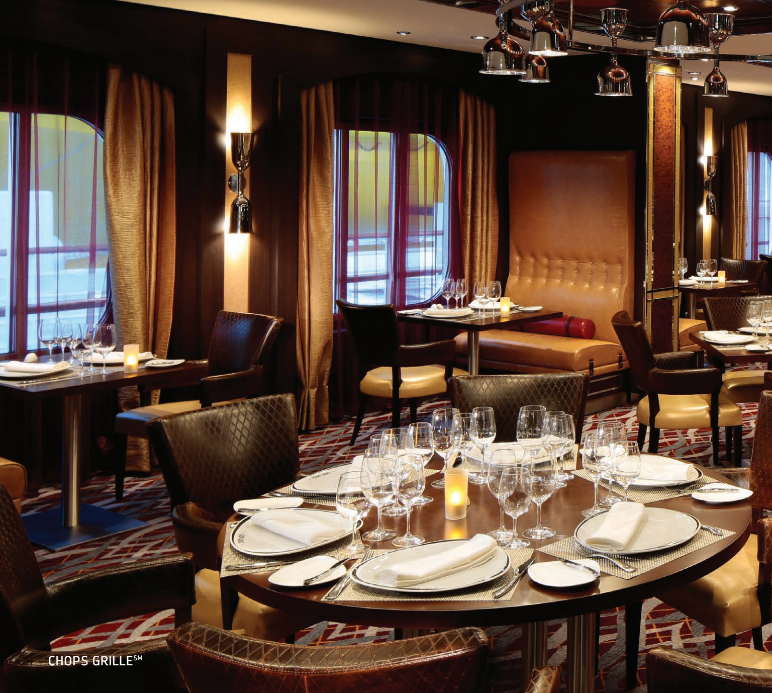
CHOPS GRILLE SM