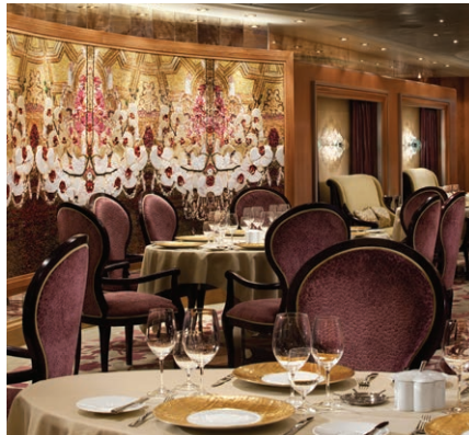
150 Central Park