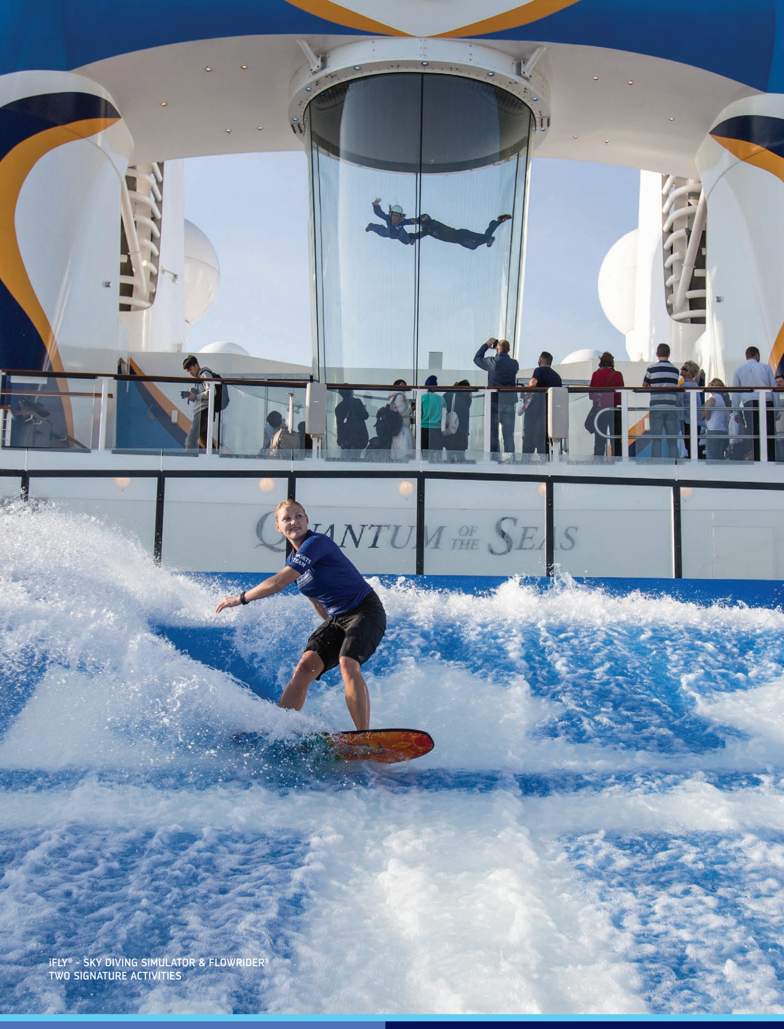
iFLY® - SKY DIVING SIMULATOR & FLOWRIDER® TWO SIGNATURE ACTIVITIES