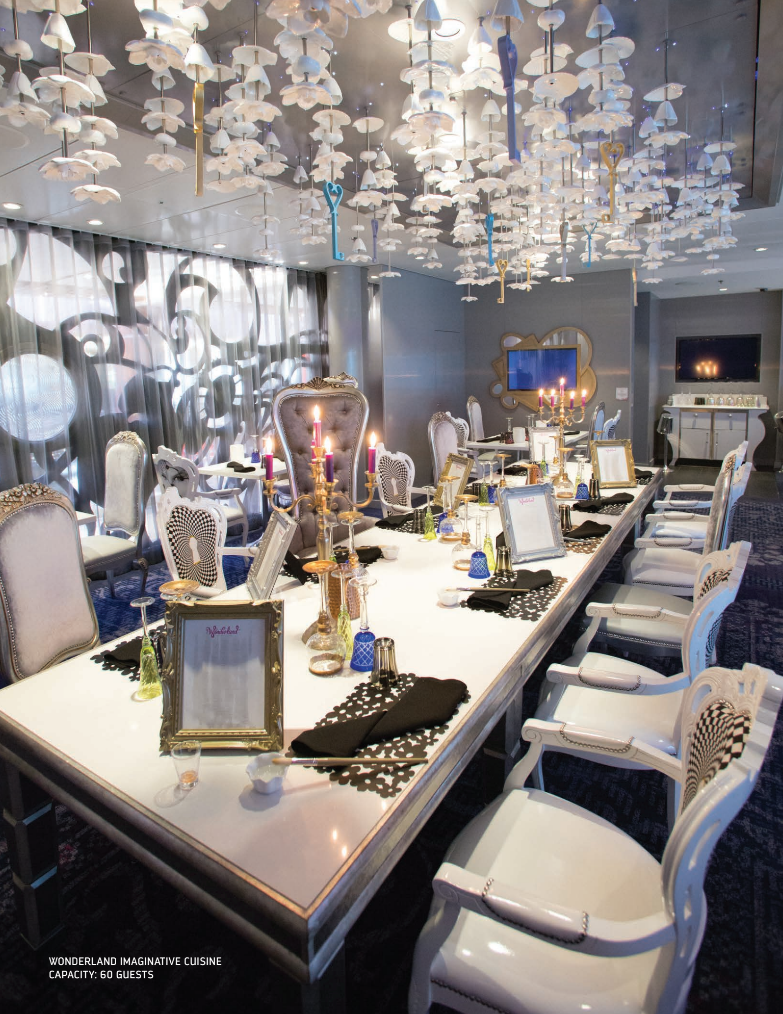
WONDERLAND IMAGINATIVE CUISINE CAPACITY: 60 GUESTS