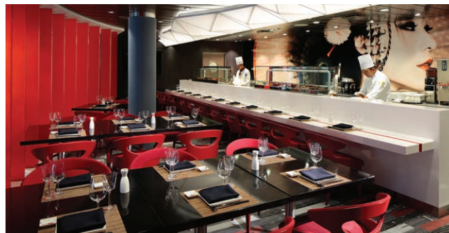
Izumi Japanese Cuisine