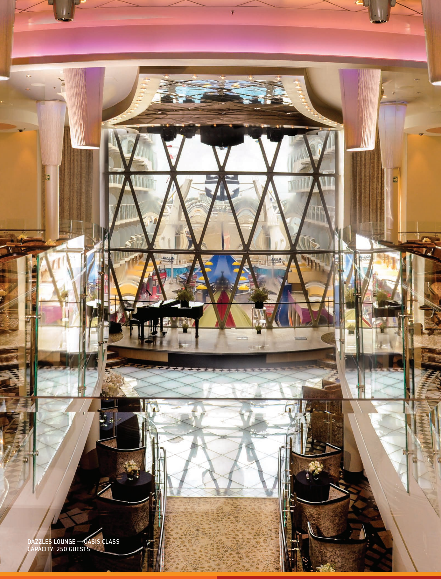
DAZZLES LOUNGE — OASIS CLASS CAPACITY: 250 GUESTS