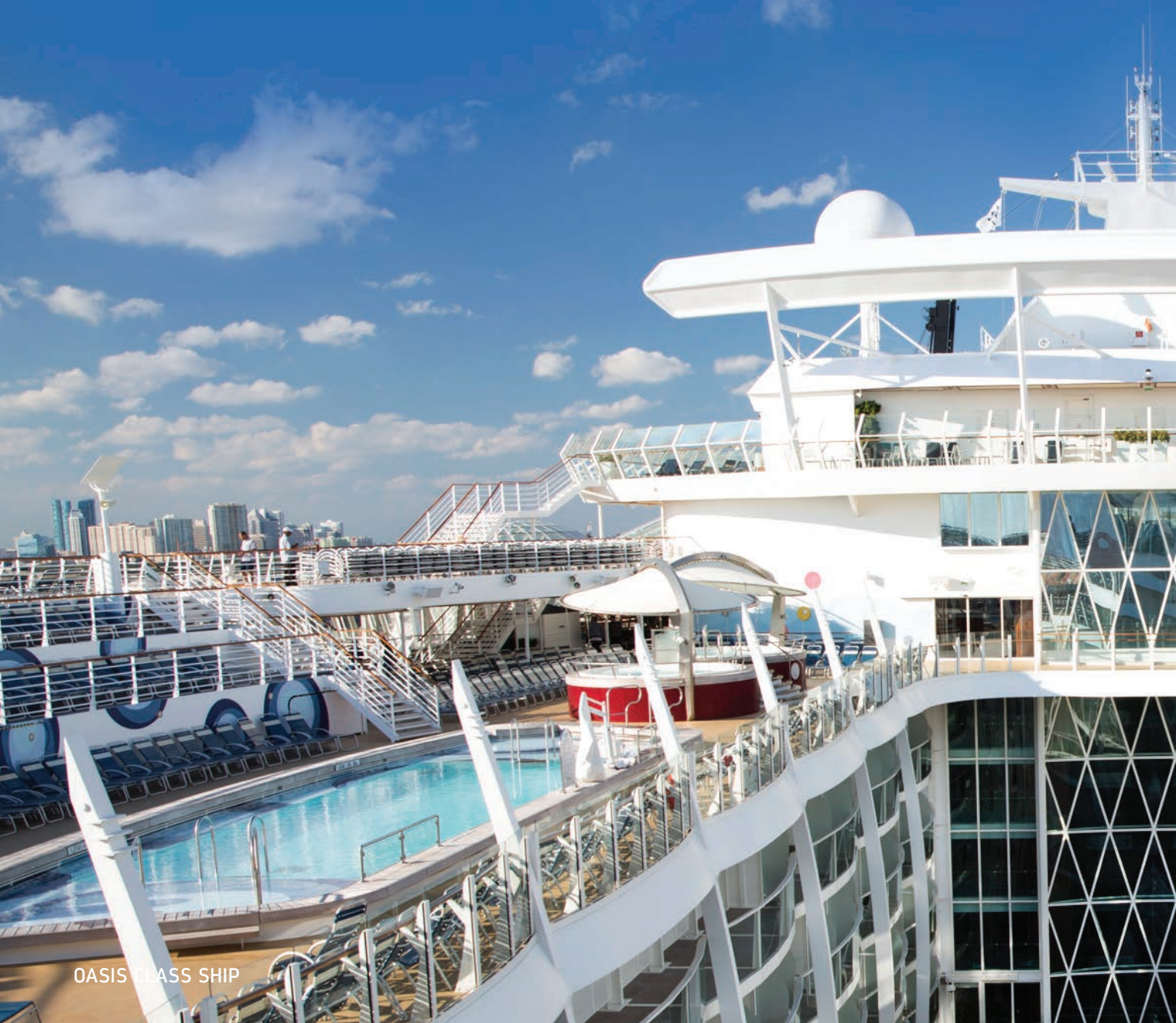
OASIS CLASS SHIP