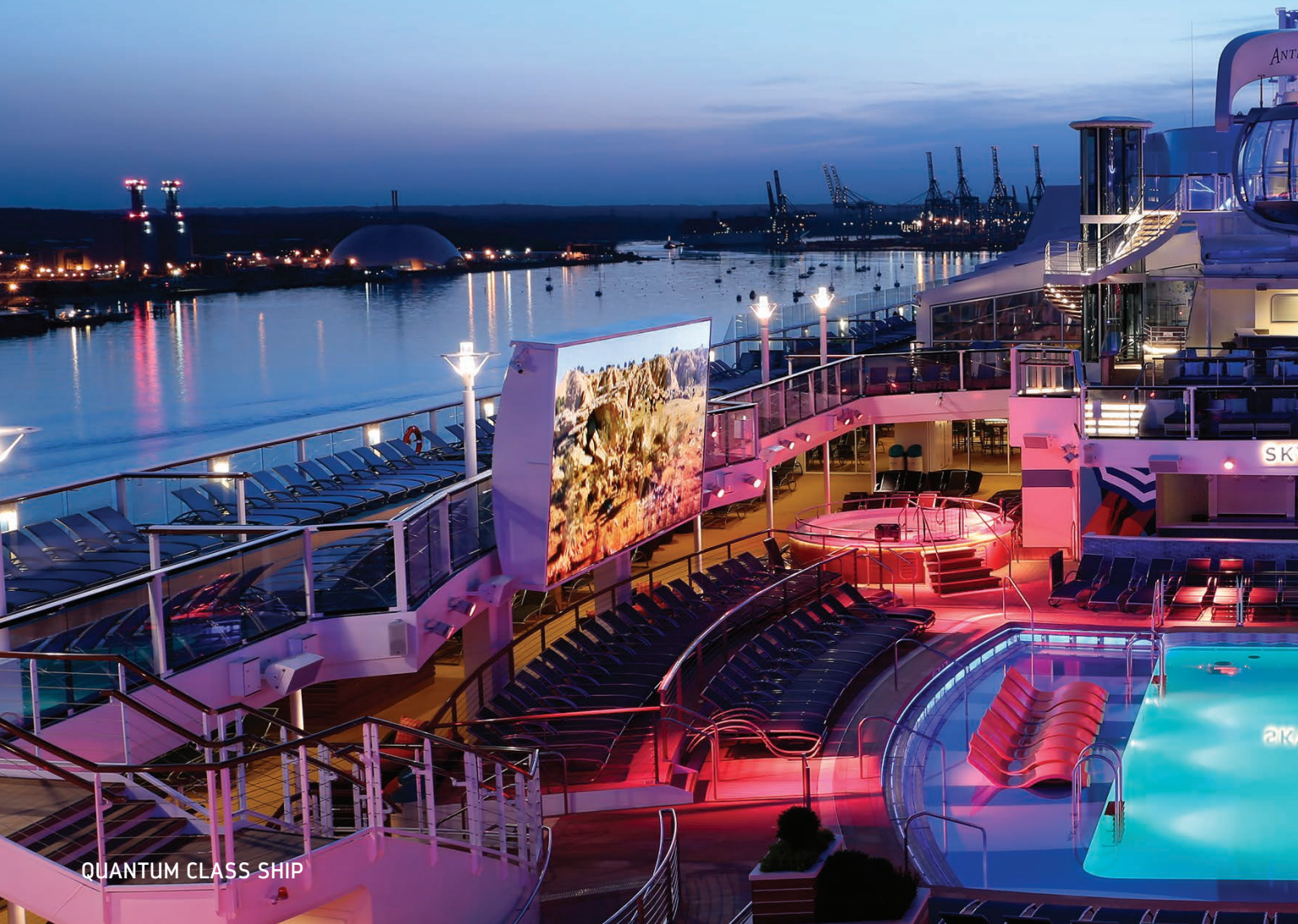
QUANTUM CLASS SHIP