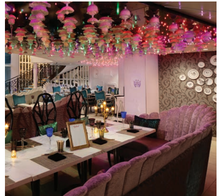
Wonderland Imaginative Cuisine