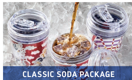
CLASSIC SODA PACKAGE

$31 PER PERSON/PER DAY INCLUDING GRATUITY